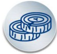
Wood & Paper